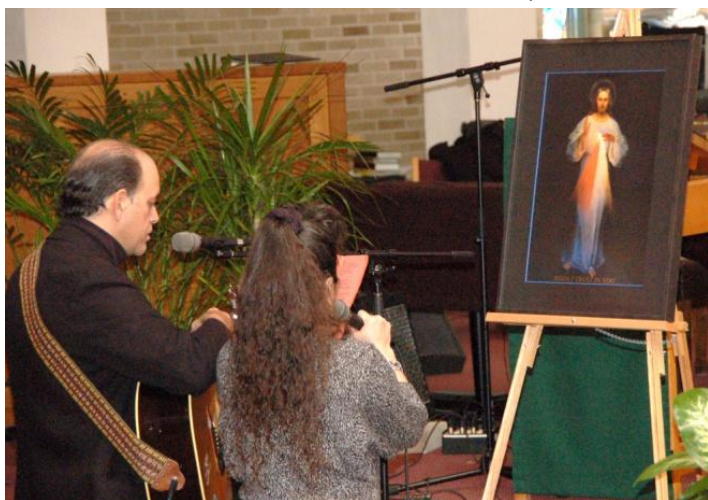
Leading the Divine Mercy Chaplet at the World Apostolate of Fatima Marian Congress in West St. Paul, MN