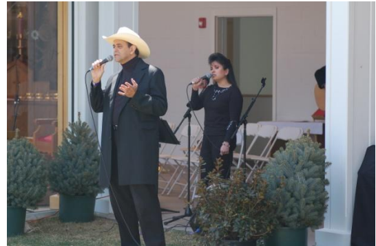
Singing "Mary Said Yes" on the world wide EWTN broadcast of the Divine Mercy Sunday Mass, Stockbridge, MA on April 19, 2009 for the Marians of the Immaculate Conception.

One Of The Most Inspirational, Spiritually Moving Performances To Ever Tour Catholic Parishes