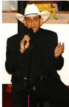
At the shrine of Our Lady of America Rome City, IN