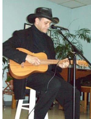
Performance in Washington DC for the Sisters of Charity