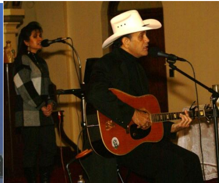
In Rome City Indiana at the National Shrine of Our Lady of America