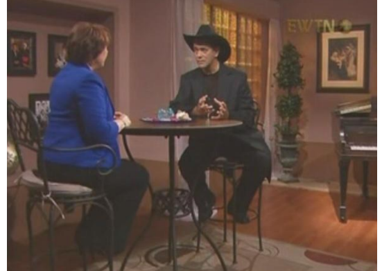
Appearing on EWTN's Dana & Friends show