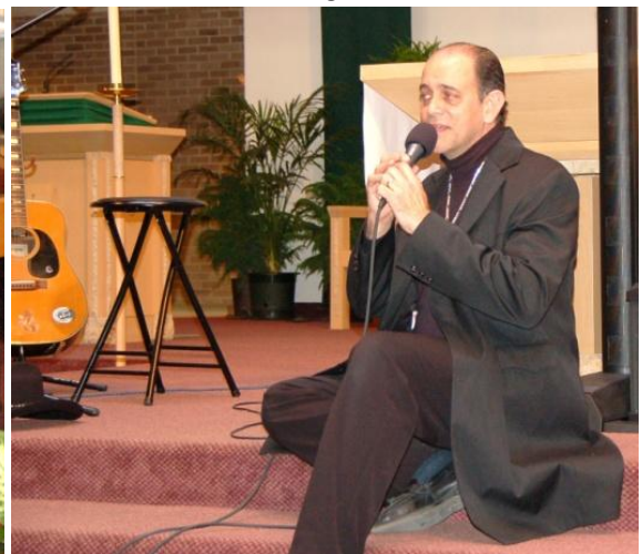
During the performance at the 25 th Annual Marian Congress in West St. Paul, MN.