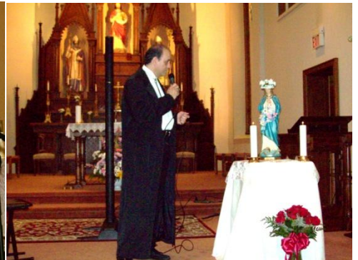
Performance at the Sacred Heart Parish in Lawrenceburg TN