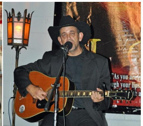
Our Sorrowful Mothers Ministry show in Vandalia, IL