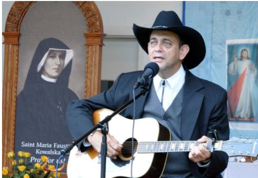
Performing THE SHOW at the 50 th Anniversary of the Divine Mercy Shrine of the Marians of the Immaculate Conception in Stockbridge, MA May 29, 2010